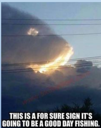
THIS IS A FOR SURE SIGN IT'S GOING TO BE A GOOD DAY FISHING.