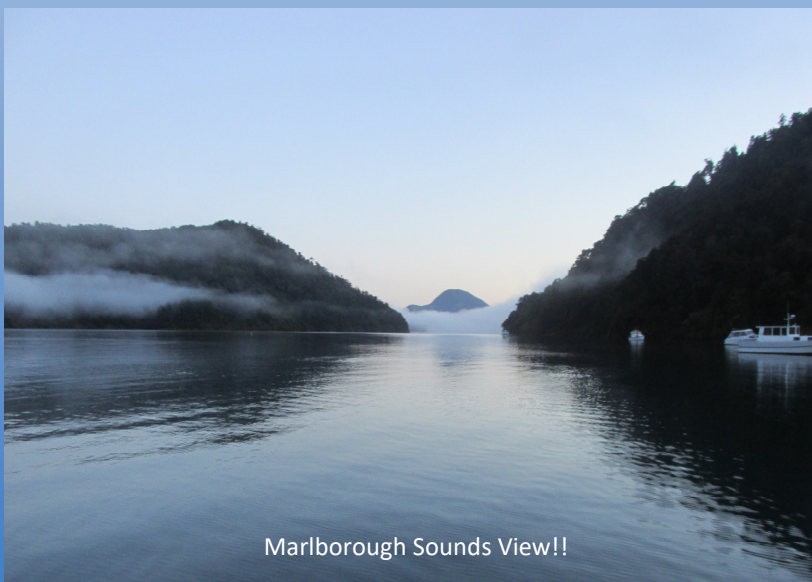
Marlborough Sounds View!!