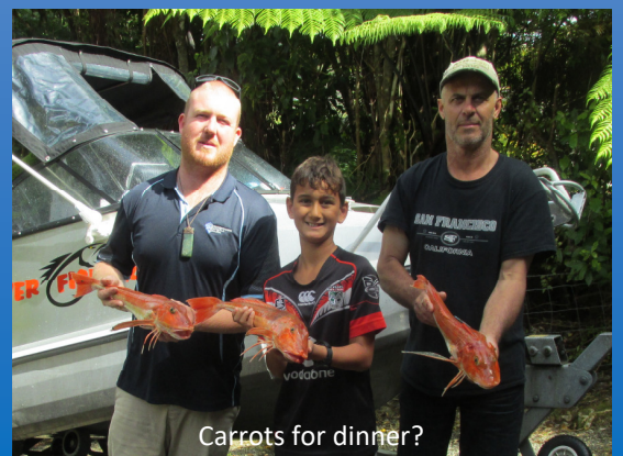
Carrots for dinner?

Don't forget to add a few brief details about the photo.